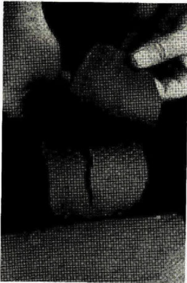
THIS ELBOW GASH DEFEATED EVERY EFFORT TO BE PERMANENTLY PATCHED WITH NEOPRENE AND BLACK GOOP, BUT AQUASEAL CLOSED IT TIGHT.

Everything but flattening out the arm was simple. I stacked books on the suit to keep it flat, but the gash was so long that the suit still was curved. Nevertheless, my effort was successful, the hardened Aquaseal was clear, transparent, and water-tight.