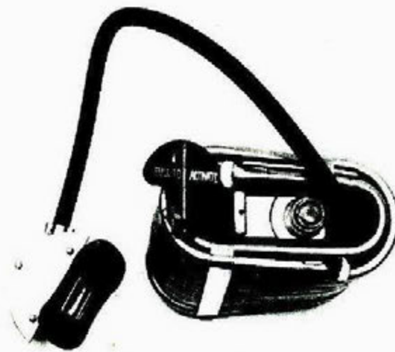
Lear-Siegler's Emergency Breathing Device

The prototype is being developed by Lear-Siegler under Navy contract. Whether such a useful device ever makes it to the scuba diving market depends on whether there's sufficient demand to permit the EBD to be produced at a reasonable price. We hope so. Instructors could pack them around for training dives.